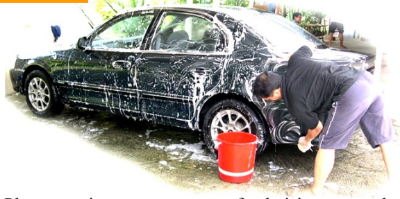
Please continue to support our fundraising car wash services. Enquiries: 604-910-3228/604-370-1692.