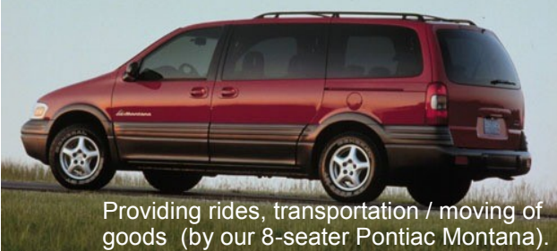
Providing rides, transportation / moving of goods (by our 8-seater Pontiac Montana).

我們有一輛八座位的 Pontiac-Montana，可提供車載、小型或少量貨物運載。